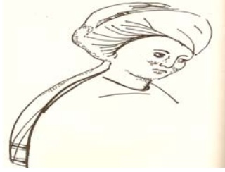
شکل رقم (۱)