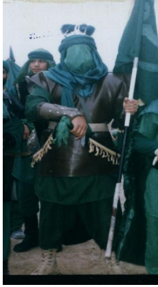
شکل رقم (۱۸)