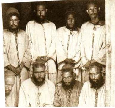
شکل رقم (۳)