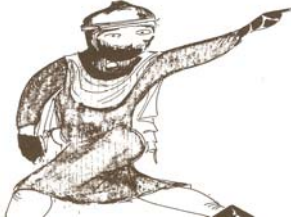
شکل رقم (۲)