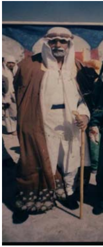
شکل رقم (۱۹)