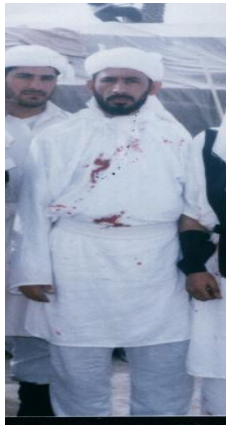
شکل رقم (۲۰)