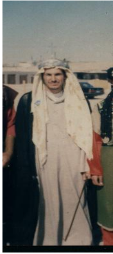
شکل رقم (۱۶)