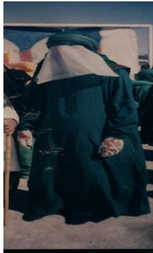
شكل رقم (١٢)