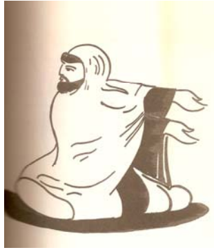
شکل رقم (۸)